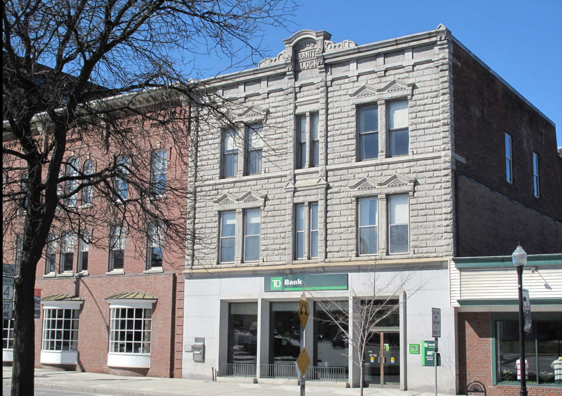
Photograph 37: View looking southwest at Averill's Block (left), HD #18, and Granite Block (right), HD #19