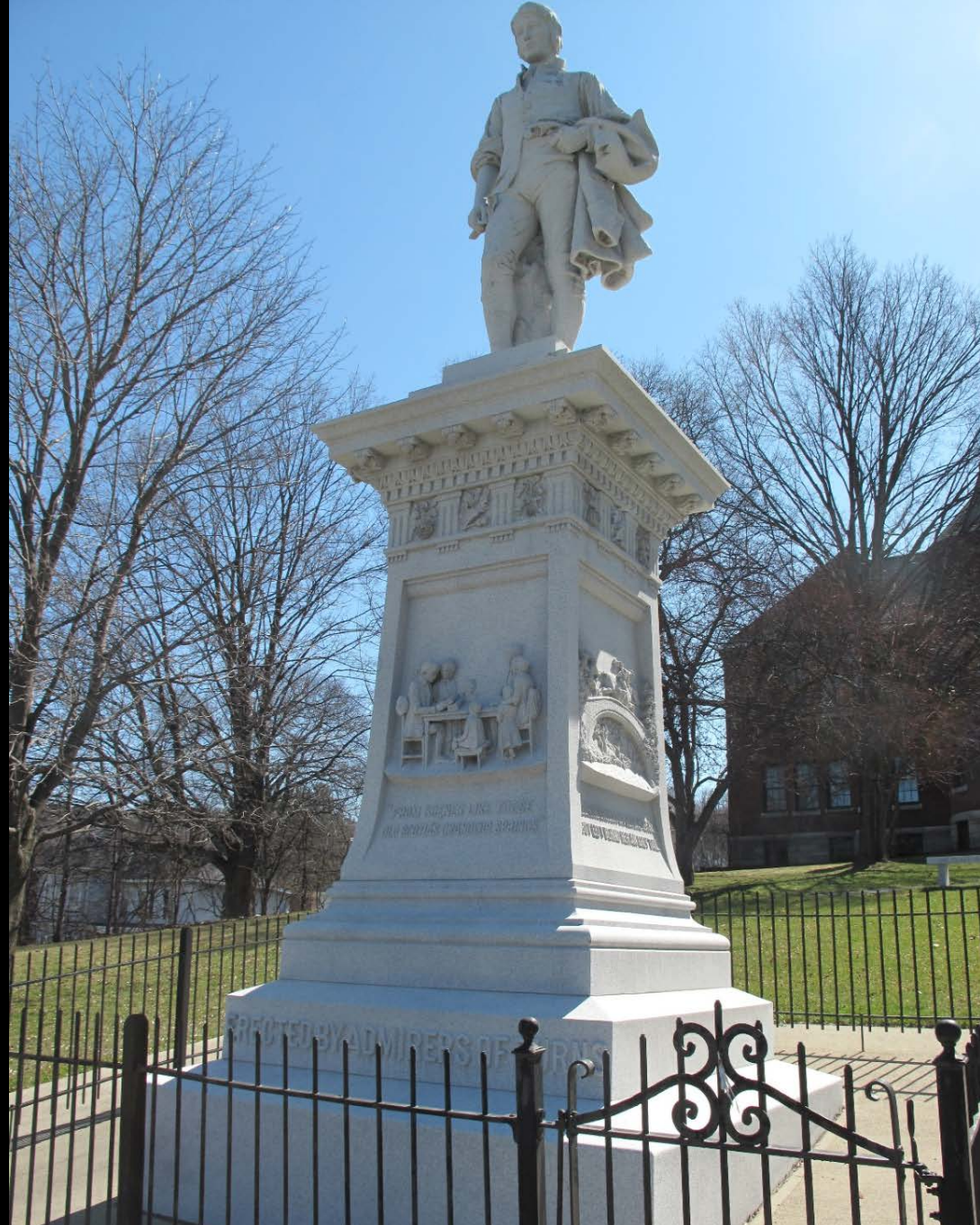
Photograph 22: View looking east at Robert Burns Monument, HD #9a