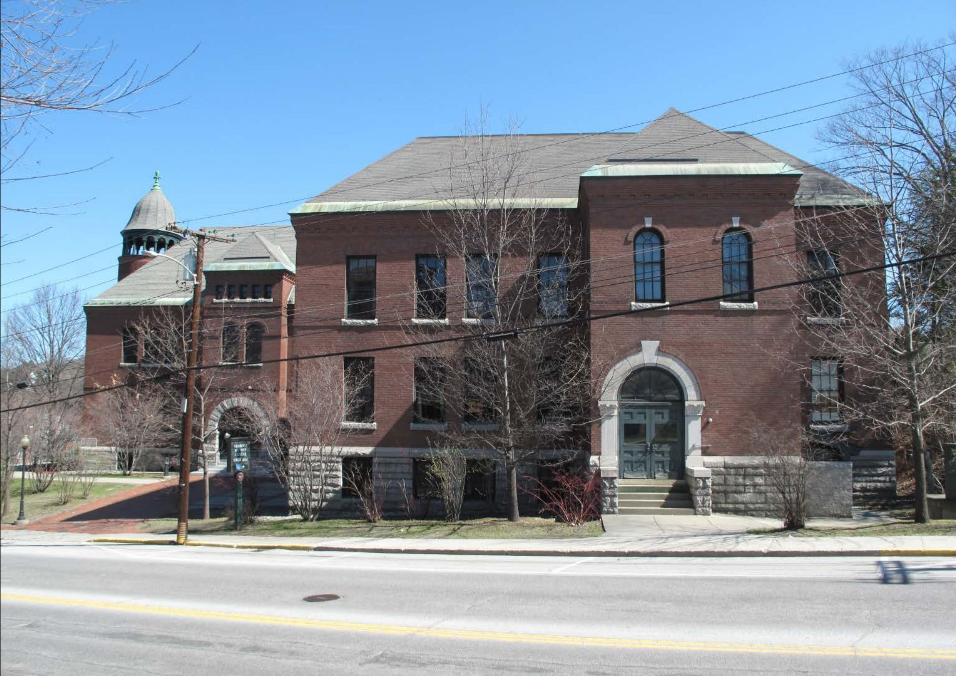
Photograph 20: View looking northeast at Spaulding Graded School/Vermont Historical Society,