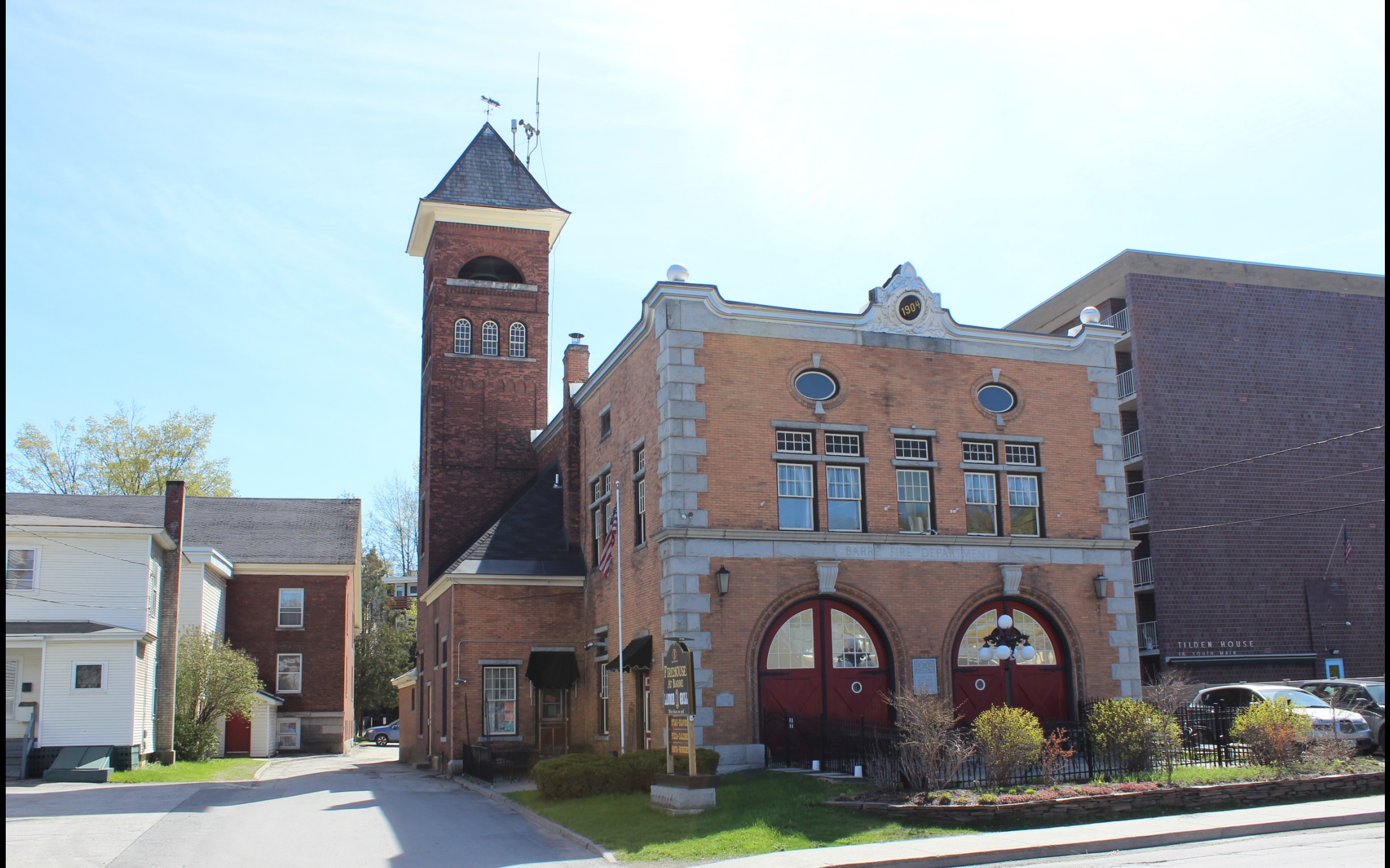
Photograph 31: View looking southeast at front and side elevations of Barre Fire Station, HD #14