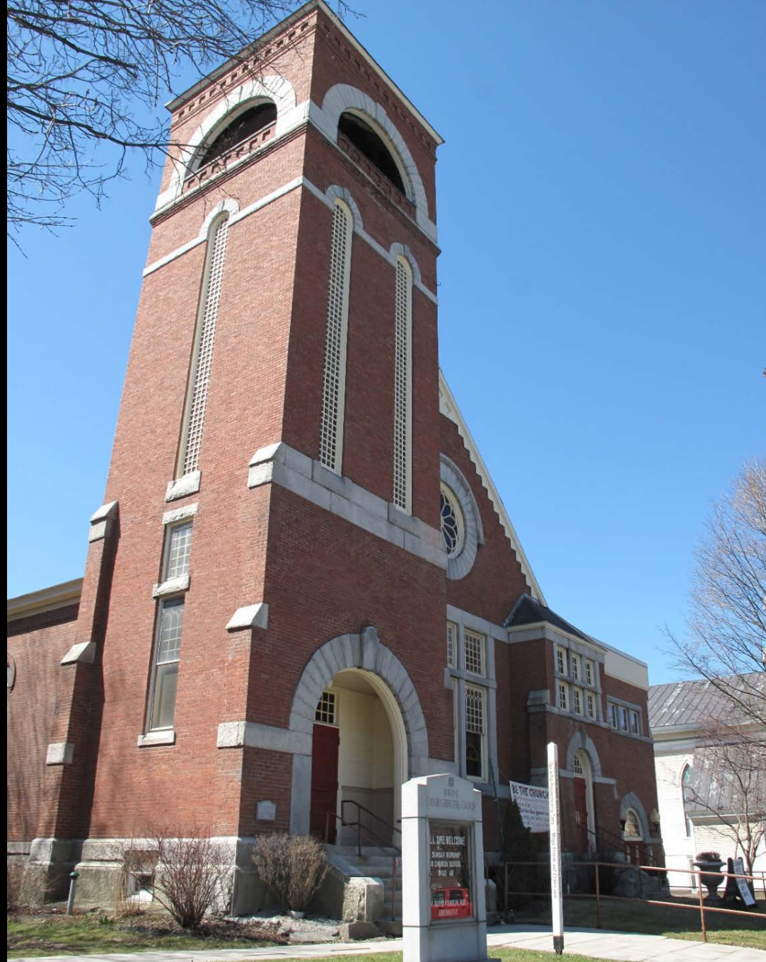
Photograph 26: View looking southwest at Barre Congregational Church, HD #12