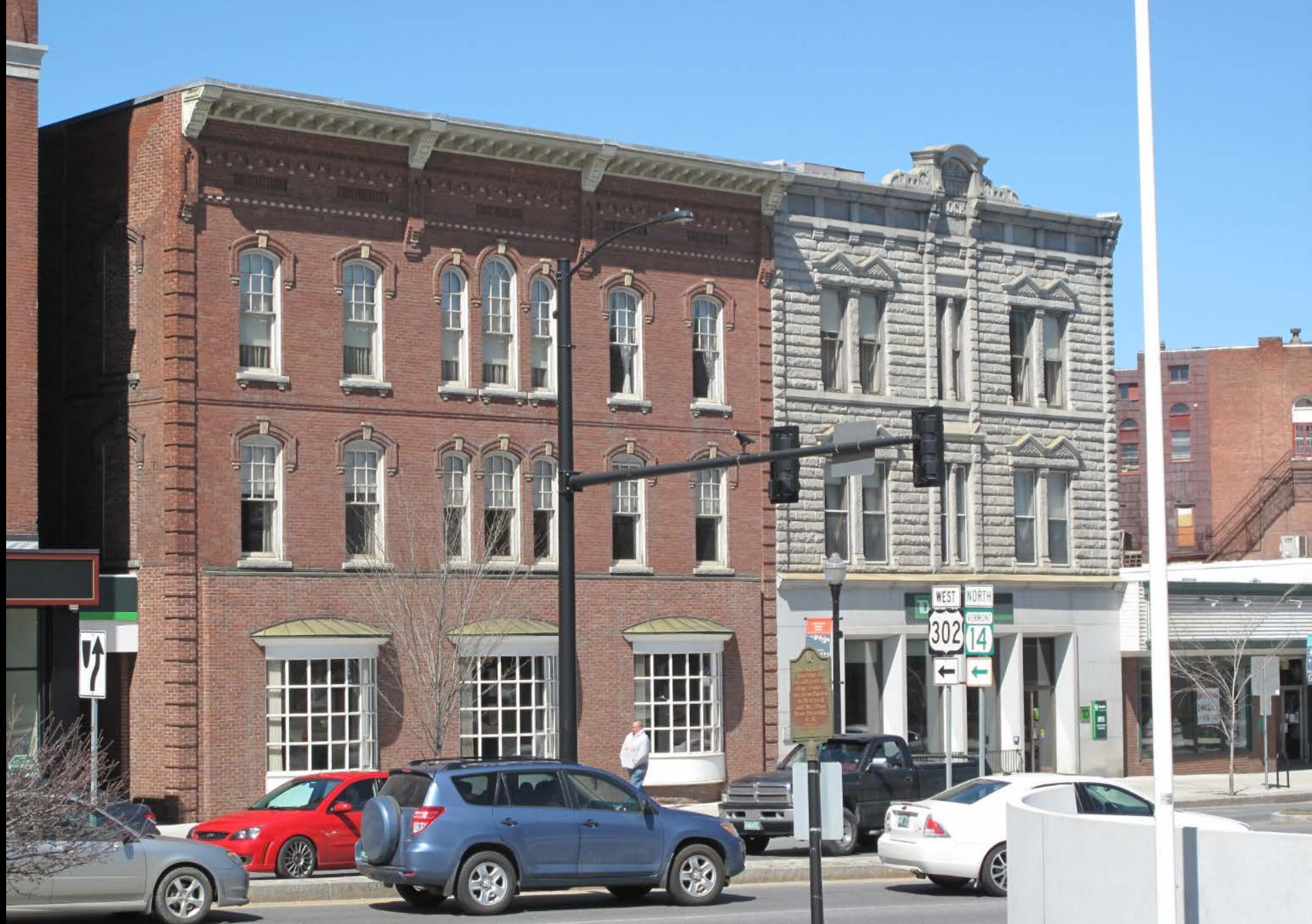
Photograph 36: View looking west at Averill's Block (left), HD #18, and Granite Block (right), HD #19