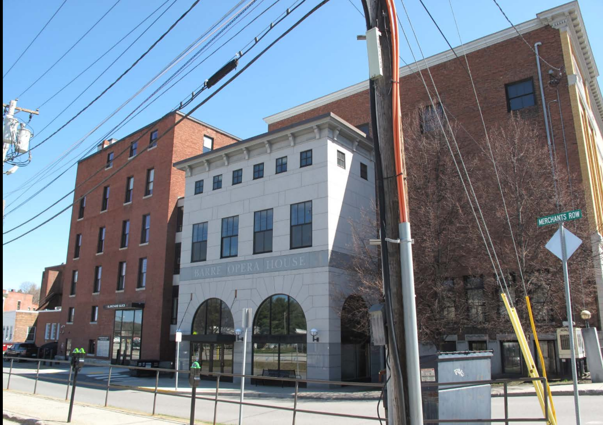
Photograph 35: View looking northeast at rear elevations of A.C. Blanchard Block (left), HD #17,