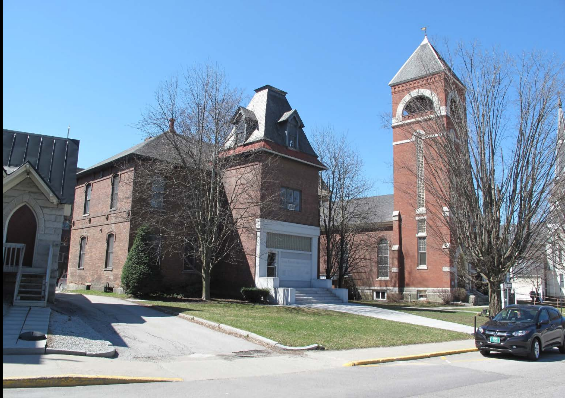
Photograph 24: View looking southwest at Church Street School (center), HD #11,