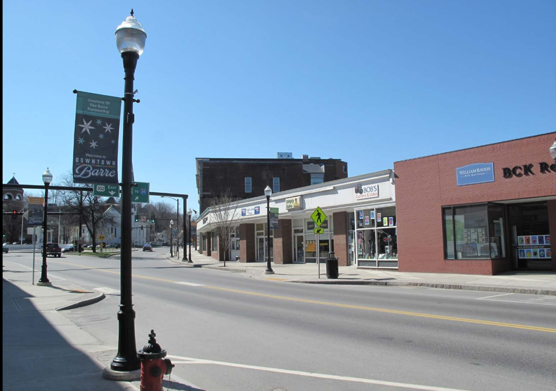
Photograph 38: View looking south at Commercial Building (center), HD #20, and Commercial Building (right), HD # 21