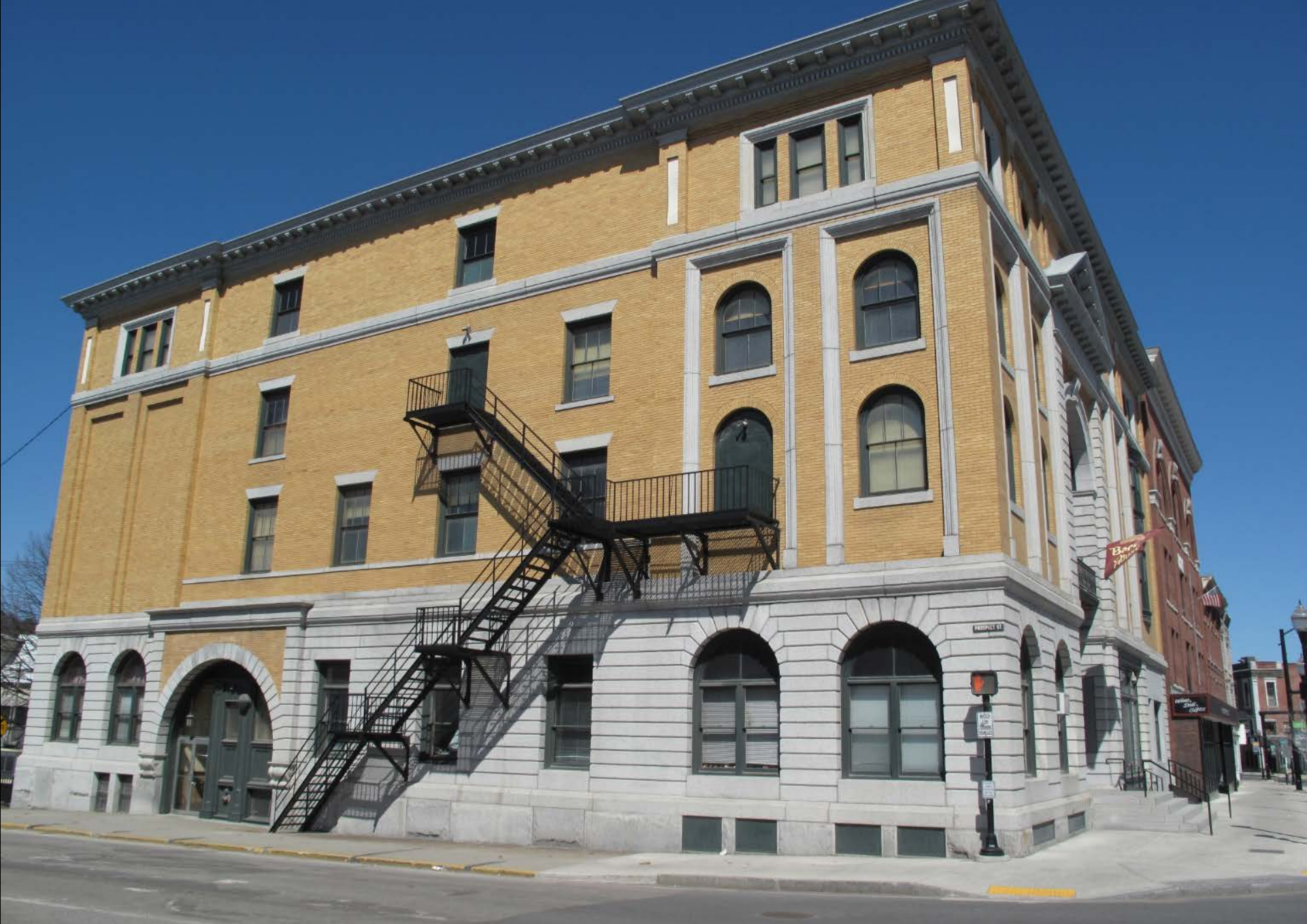
Photograph 34: View looking northwest at side and front elevation of Barre City Hall and Opera House, HD #16