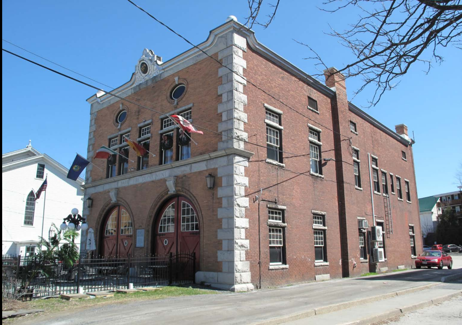
Photograph 30: View looking north at front and side elevations of Barre Fire Station, HD #14