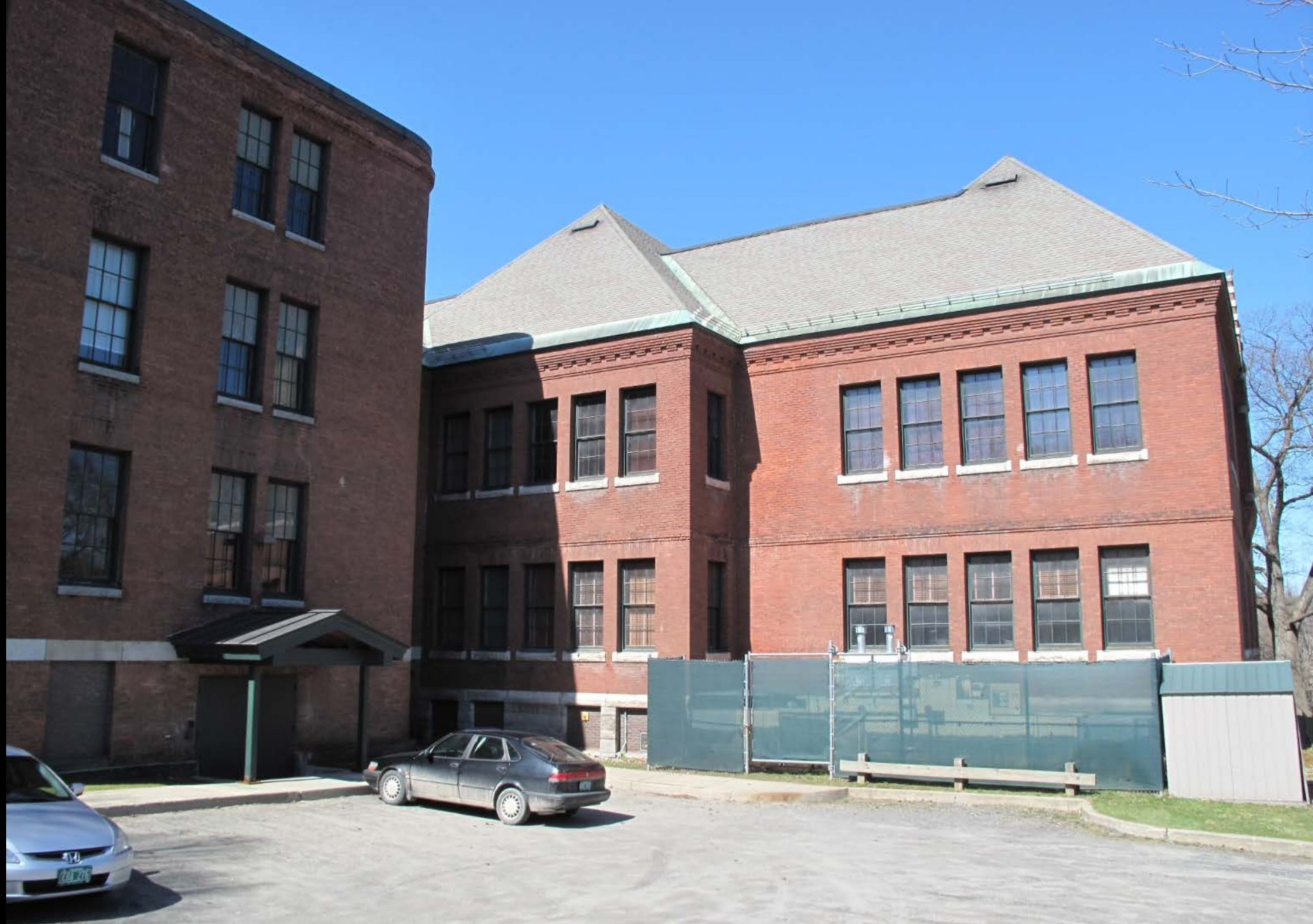
Photograph 21: View looking west at Spaulding Graded School/Vermont Historical Society,