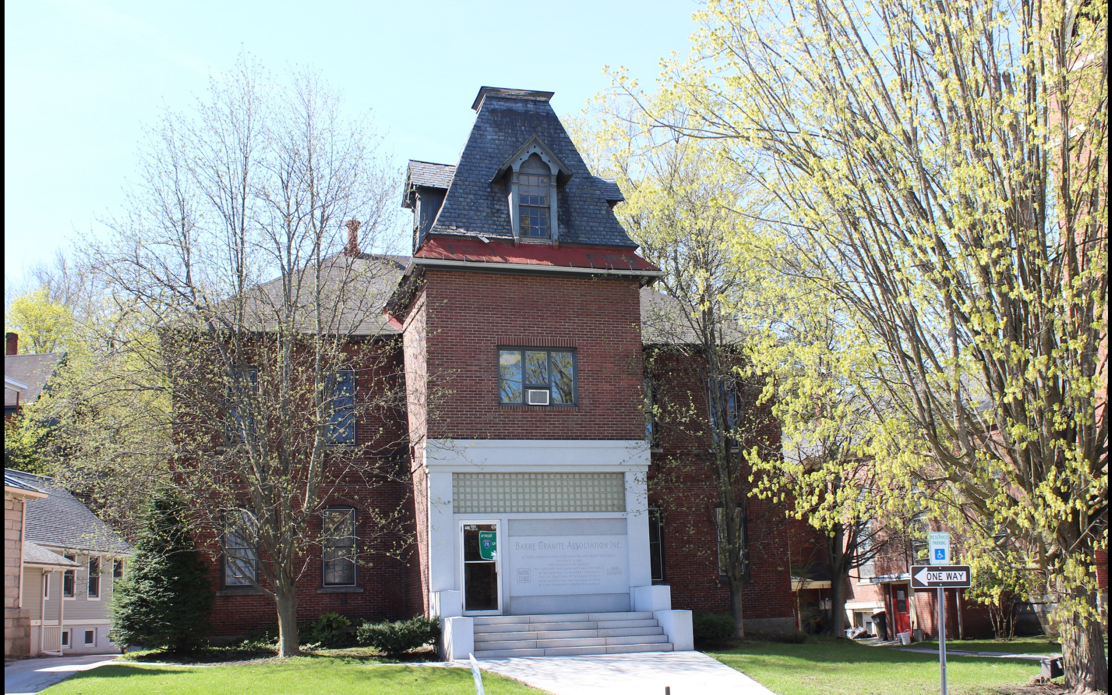
Photograph 25: View looking south at Church Street School, HD #11