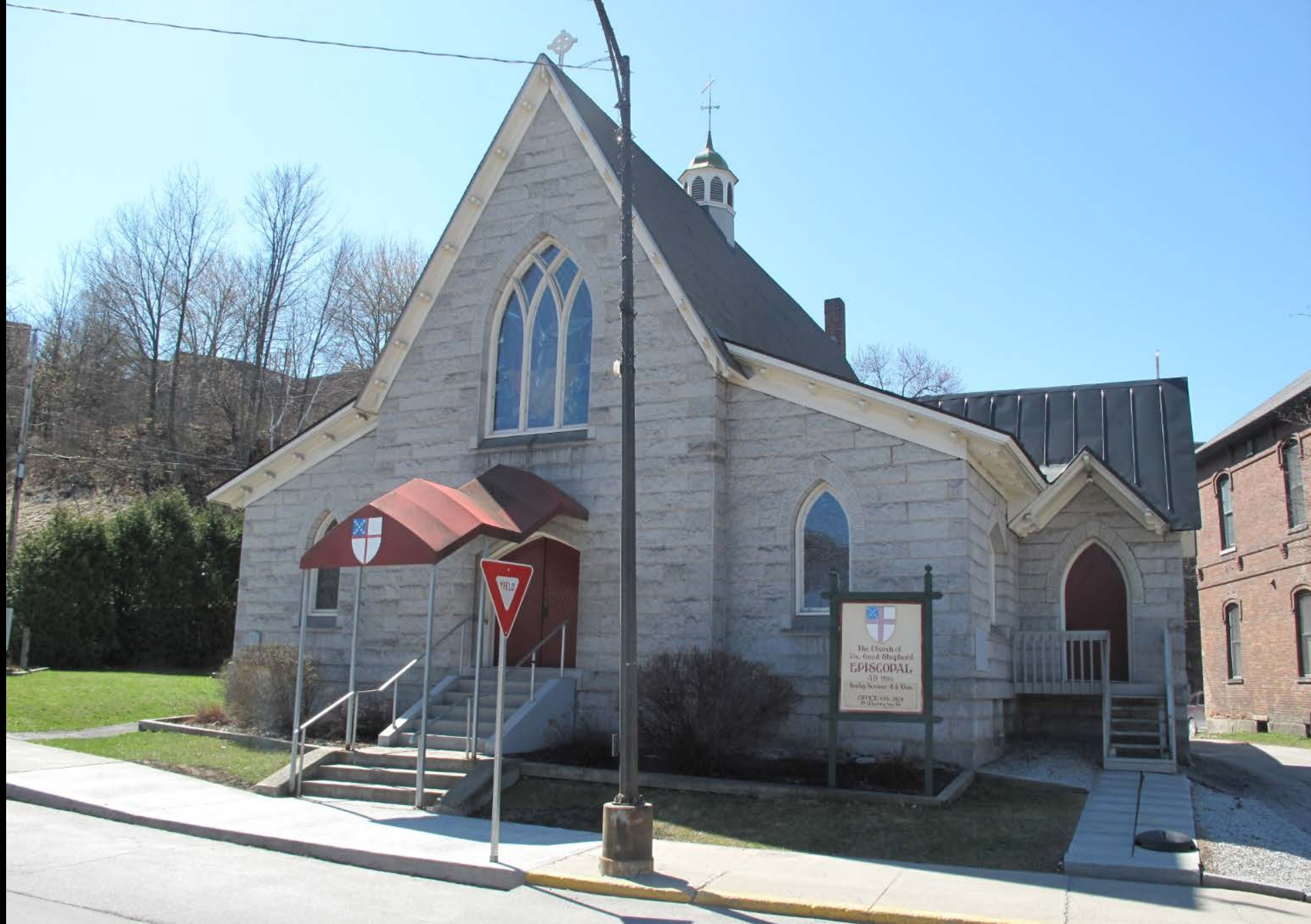
Photograph 23: View looking southeast at Church of the Good Shepard, HD #10