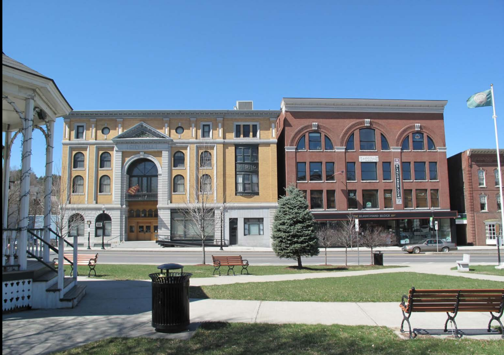
Photograph 33: View looking west, from City Hall Park, at Barre City Hall and Opera House (left), HD #16,