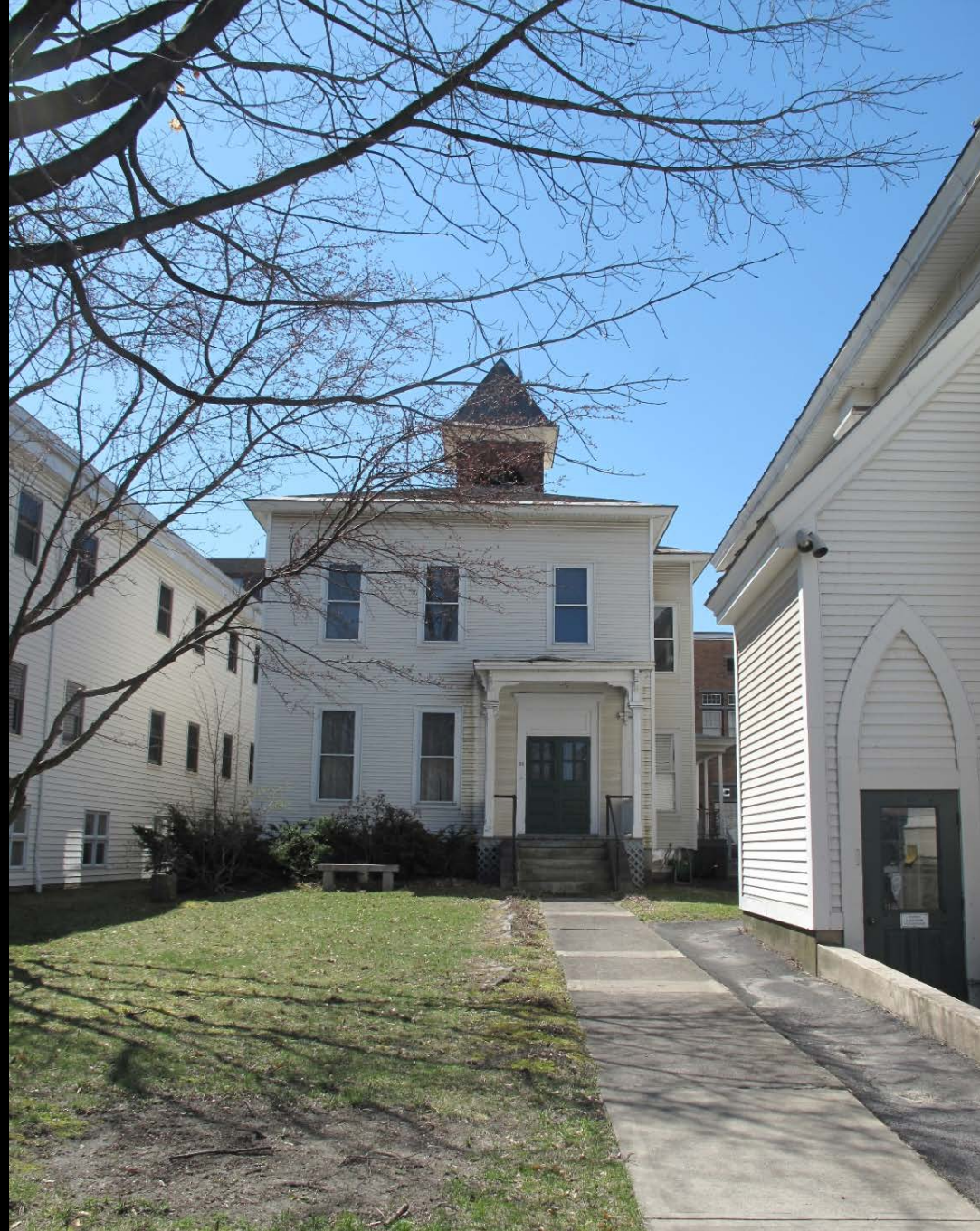
Photograph 29: View looking southwest at the Parish House, HD #13a