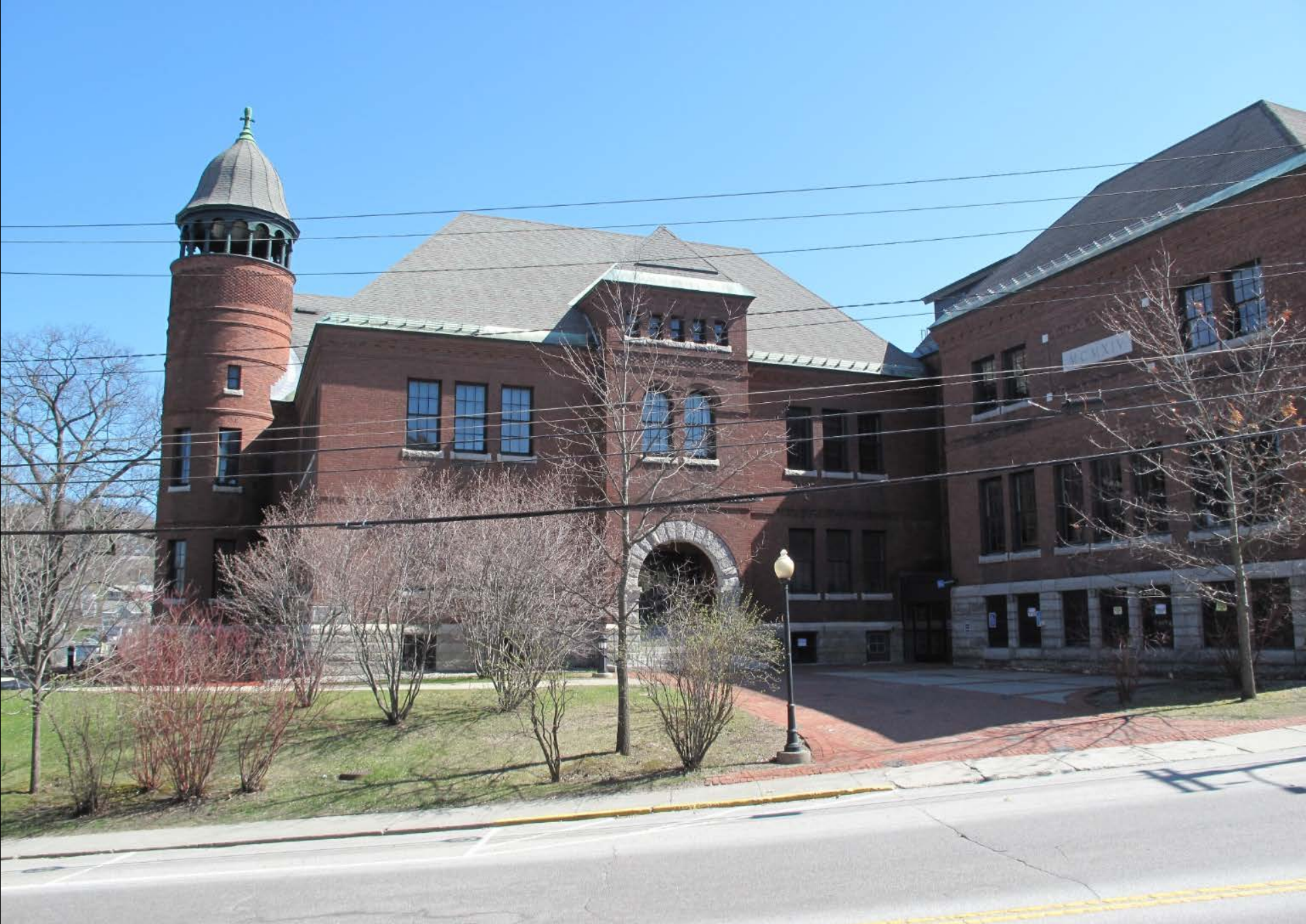
Photograph 19: View looking northeast at Spaulding Graded School/Vermont Historical Society,