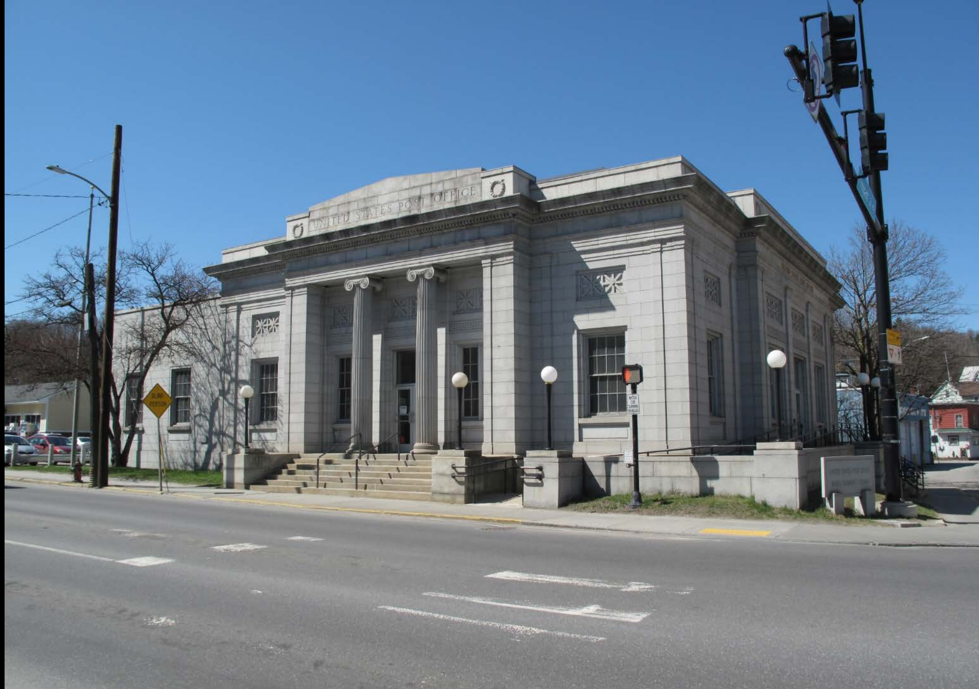
Photograph 32: View looking southwest at United States Post Office, HD #15