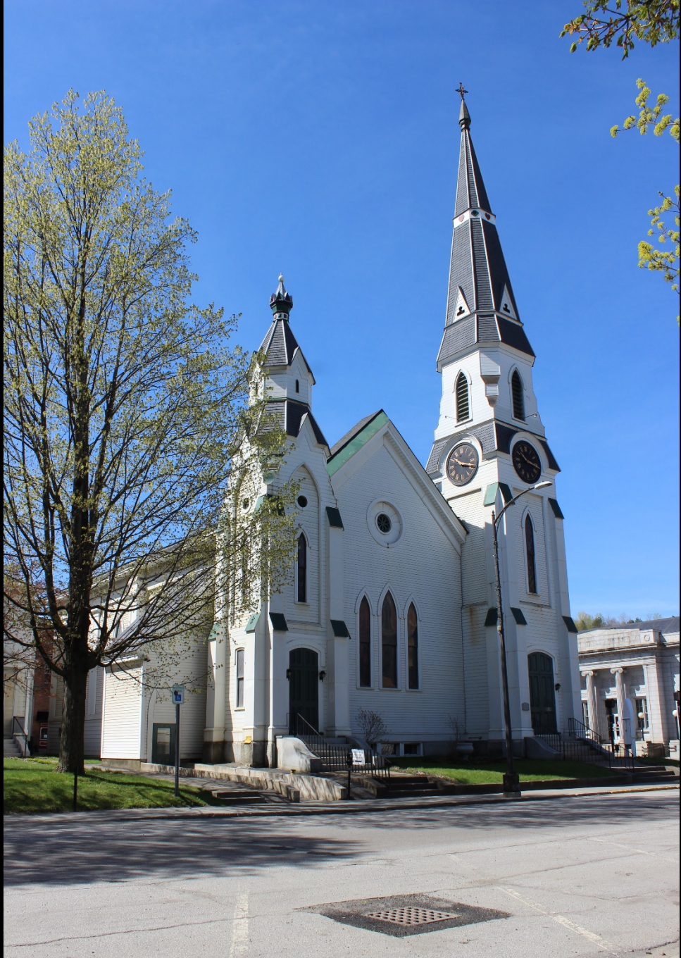
Photograph 27: View looking southwest Universalist Church, HD #13